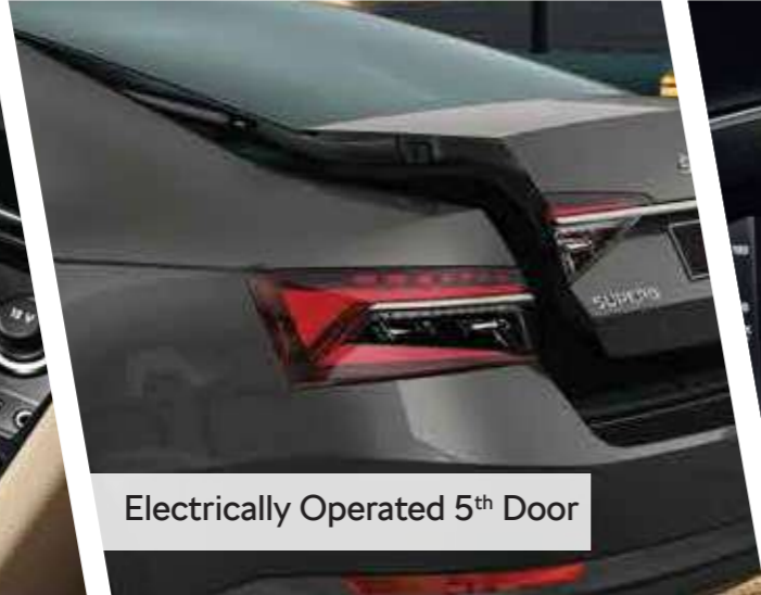
Electrically Operated 5 th Door