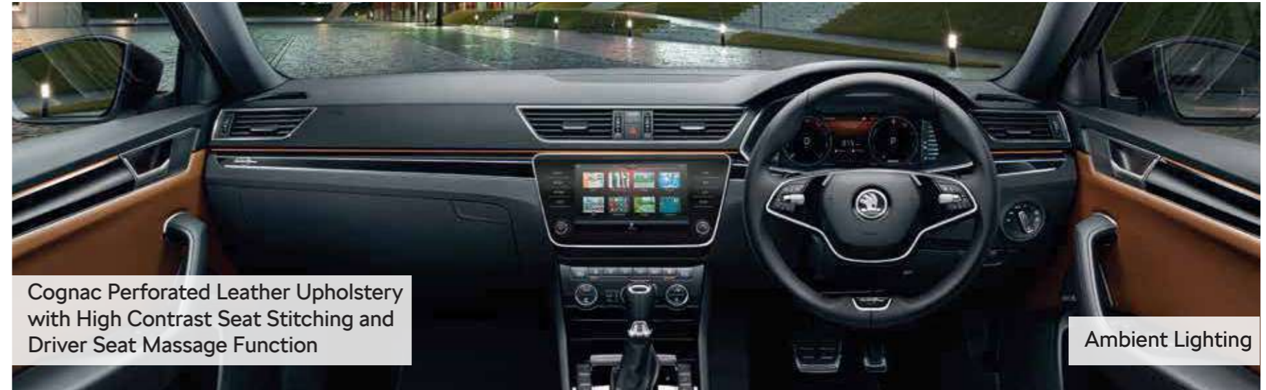
Cognac Perforated Leather Upholstery with High Contrast Seat Stitching and Driver Seat Massage Function