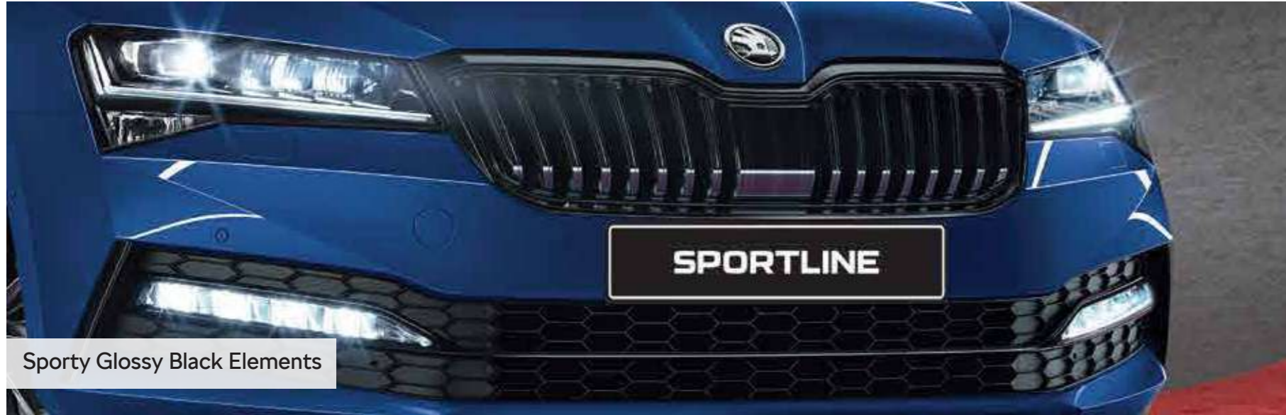
Sporty Glossy Black Elements