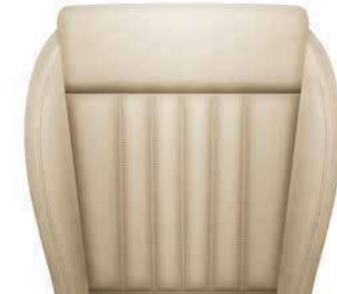
Stone Beige Perforated Leather