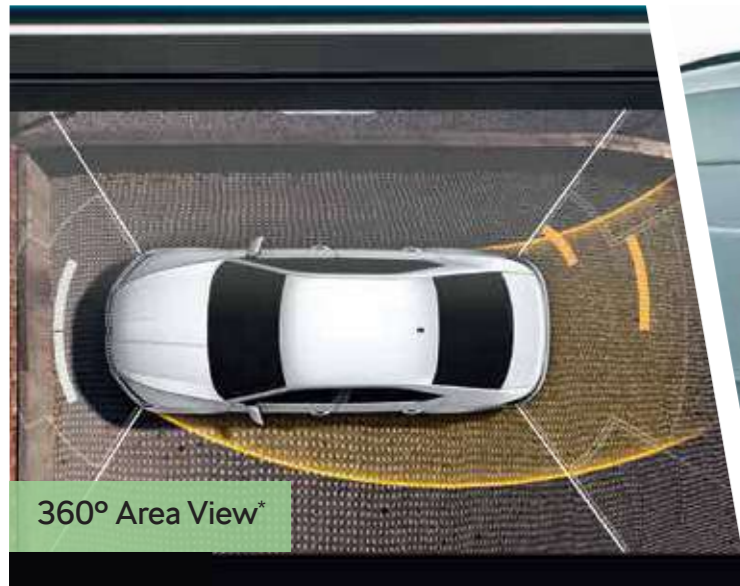
360° Area View*