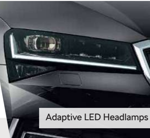
Adaptive LED Headlamps