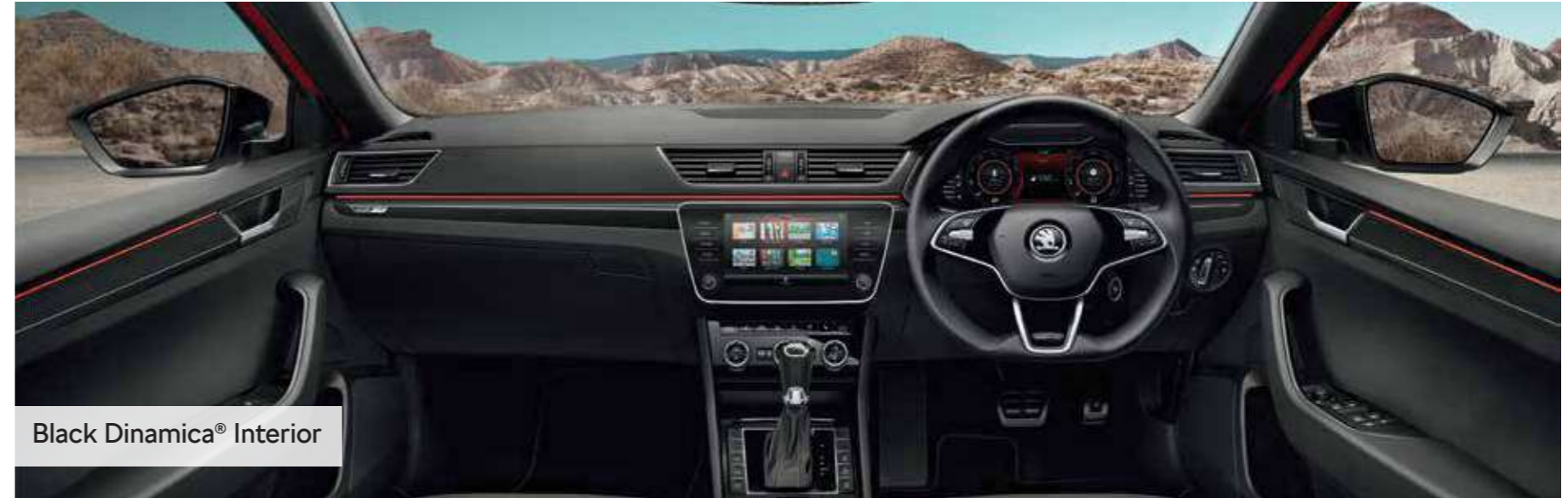
Black Dinamica® Interior