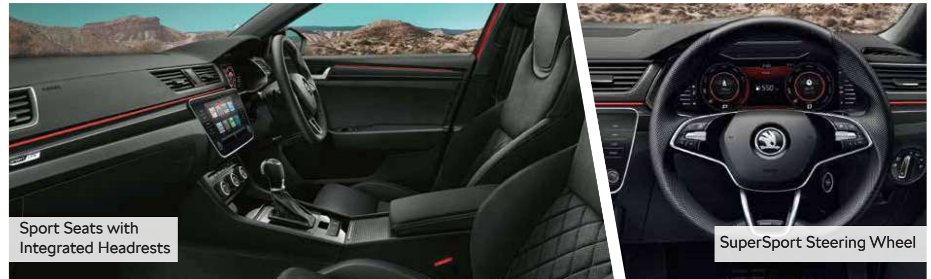
Sport Seats with Integrated Headrests