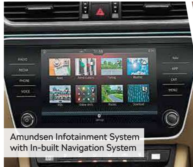
Amundsen Infotainment System with In-built Navigation System