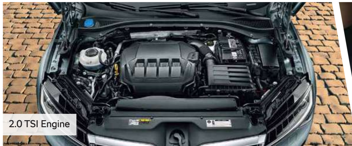
2.0 TSI Engine