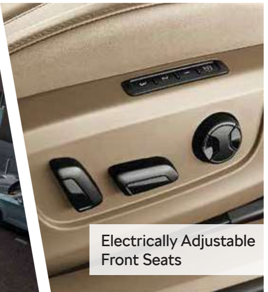
Electrically Adjustable Front Seats