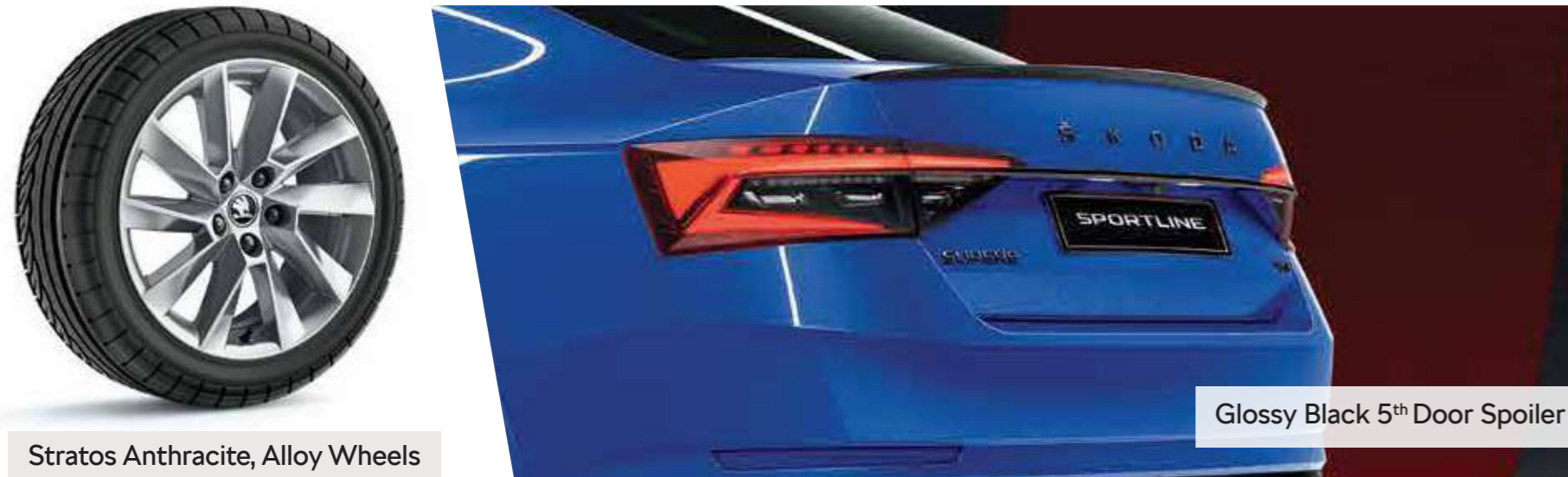
Stratos Anthracite, Alloy Wheels