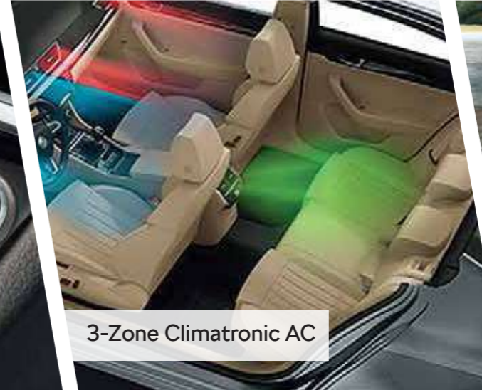
3-Zone Climatronic AC