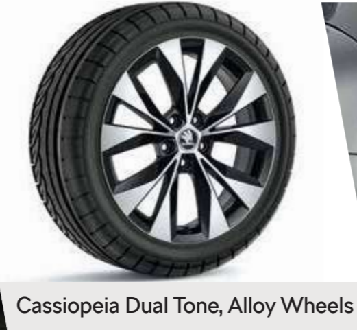
Cassiopeia Dual Tone, Alloy Wheels