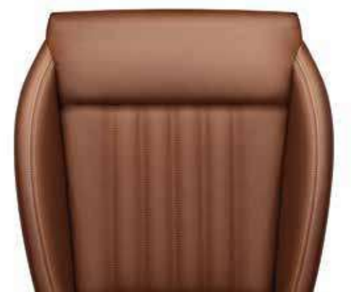
Cognac Perforated Leather