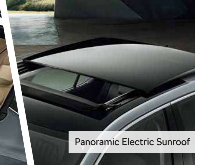
Panoramic Electric Sunroof