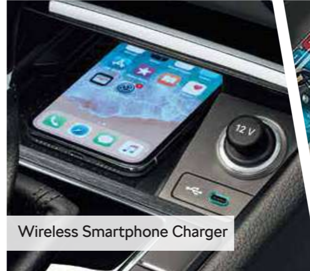
Wireless Smartphone Charger