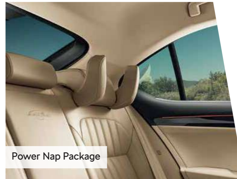
Power Nap Package