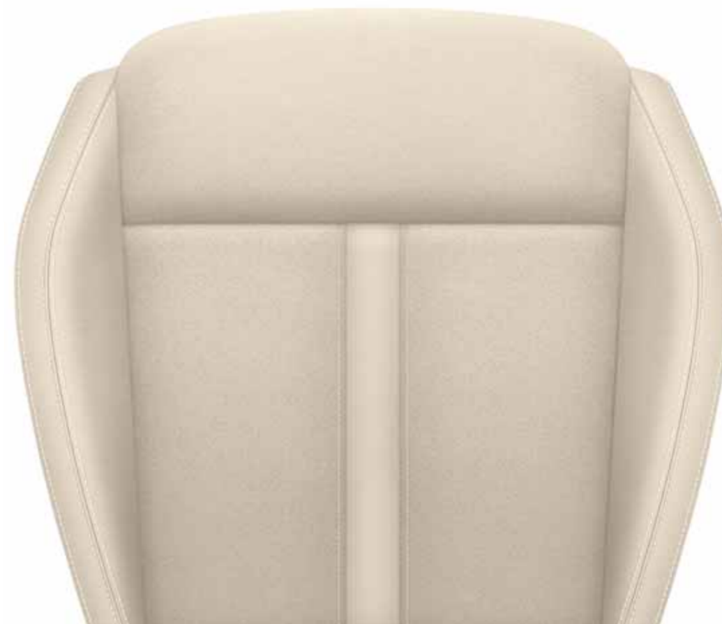
BEIGE SUEZIA LEATHER