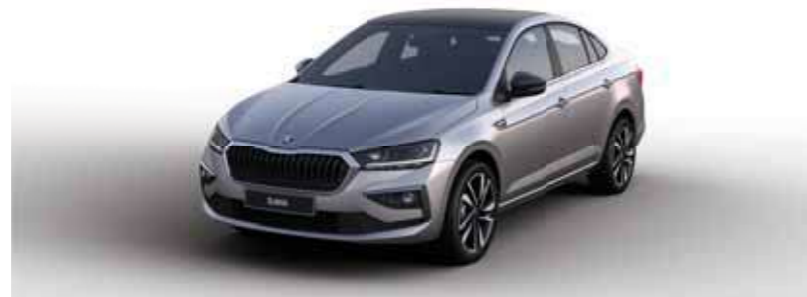
BRILLIANT SILVER WITH CARBON STEEL ROOF