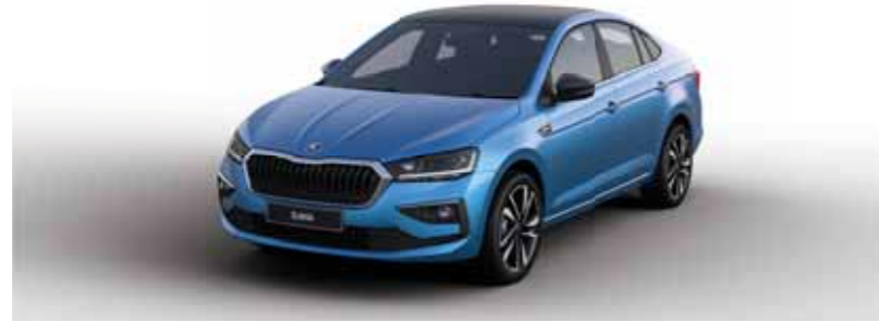
CRYSTAL BLUE WITH CARBON STEEL ROOF